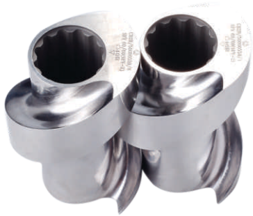
HIGHER INTAKE STEER SFV ELEMENTS