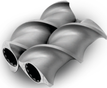
INTAKE ZONE ELEMENTS