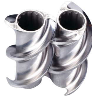
HIGHER INTAKE (SPECIAL) STEER RFV ELEMENTS