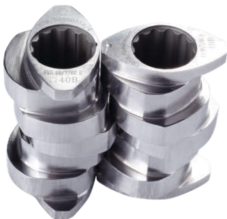
ENHANCED MIXING STEER FKB ELEMENTS