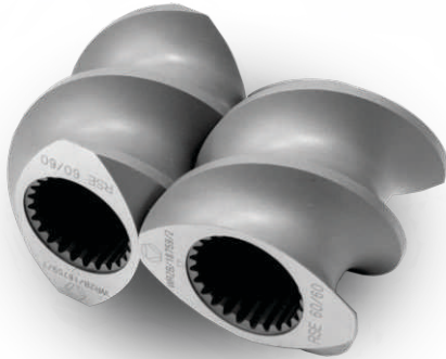
VENTING ZONE ELEMENTS