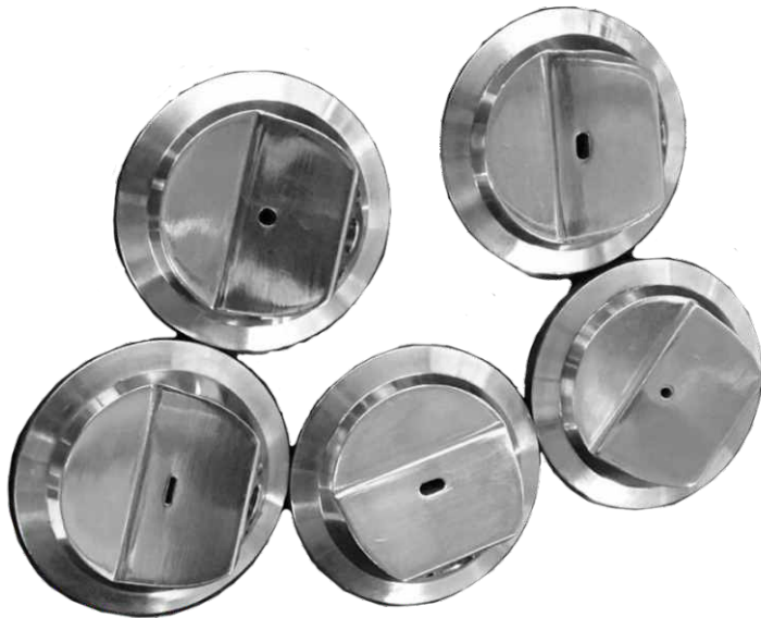
Configurable Die plates

STEER shafts are made with superior metallurgy from our very own state-of-the-art foundry, with full-fledged in-house treatment. At STEER, we have the ability to machine any contour for up to 5.5m. Our in-house torque testing facility helps rate the capacity of these shafts.