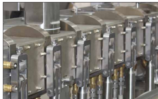
SEGMENTED BARREL – JIFFY CLAMP

Available metallurgies for the parts; X15TN, 316 SS, 316L SS, 440 SS All pharma parts are provided with Material Certificates